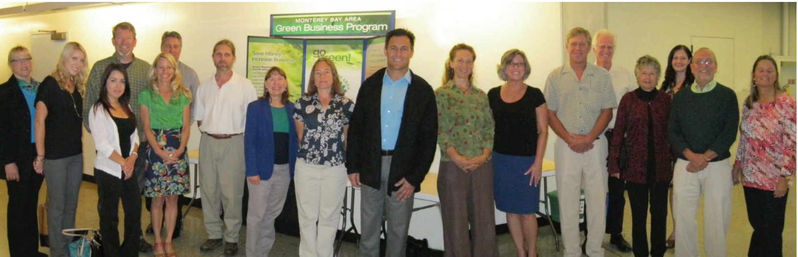
New Green Businesses honored by Santa Cruz County Board of Supervisors on October 25, 2013

Do you recycle? Conserve water? Turn the lights off when not in use?