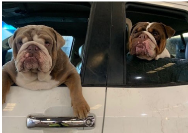
(Above) Say hello to our cool dump visitors.