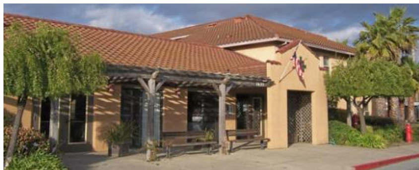
East Cliff Village Apartments, for low-income seniors and the disabled.

The County's population growth rate peaked at over 50% in the 1970s, but after growth management measures were established, the annual growth rates have fluctuated between 5 and -.42 percent per year over the past 40 years. According to the 2018 American Community Survey, average household size is 2.7 people, and most residents live in single-family homes. Approximately 59% of housing units in the County are owner occupied, and 41% are rentals. The median age is 37.9 years and is increasing year after year, reflecting an aging baby boomer generation. In terms of ethnicity, the community is mostly Non-Hispanic White, but the Hispanic/Latino population is a significant and growing segment of the population, especially in South County. In 2018, median household income was $78,041. Income disparity between high and low earners is widening as high-income workers continue to move here and commute out of the County. For more detailed demographic information, see Appendix C: Community Profile.