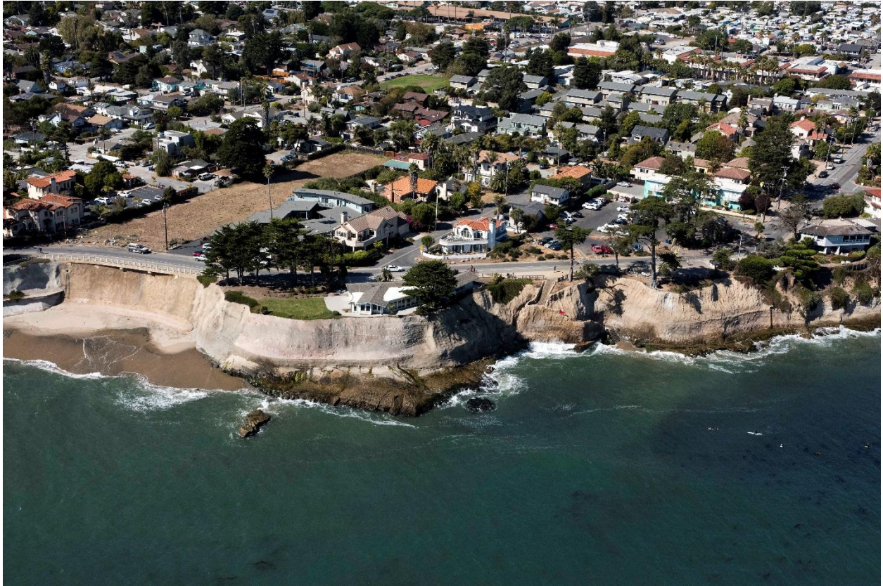
East Cliff Drive and coastline in Pleasure Point.