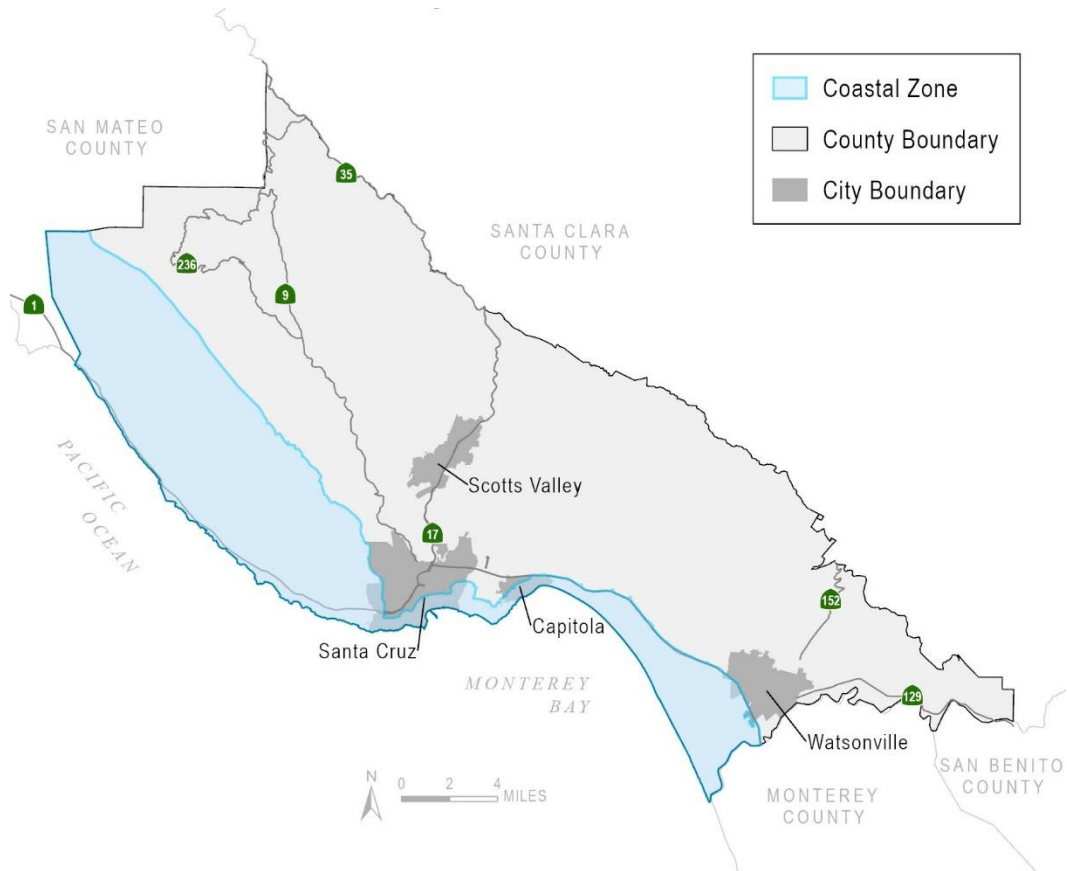
Figure 1-3: Coastal Zone

Commission maintains regulatory authority over tidelands, submerged lands, and public trust lands, as well as an appealable area. For more information about the history of the LCP in Santa Cruz County, see Appendix D: Planning History.