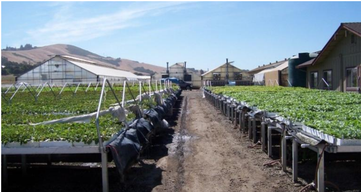
Agricultural production facility

(LCP) To maintain for exclusive agricultural uses those lands identified on the County Agricultural Resources Map as best suited to the commercial production of food, fiber and ornamental crops and livestock, and to prevent conversion of commercial agricultural lands to non-agricultural uses that are not associated with farming and/or are necessary to support the agricultural economy. To recognize that agriculture is a priority land use and to resolve policy conflicts in favor of preserving and promoting agriculture on designated commercial agricultural lands.