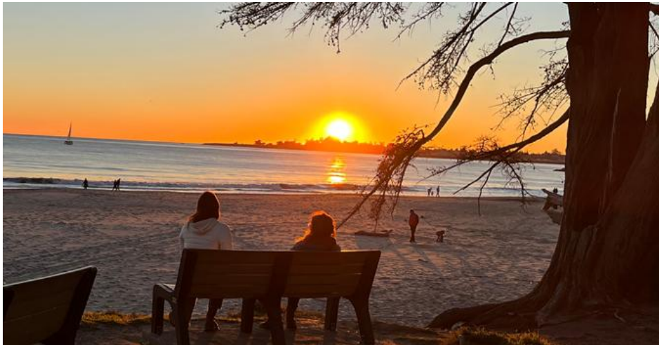
Twin Lakes State Beach

Also see Objective AM-4.1: Recreational and Coastal Access.