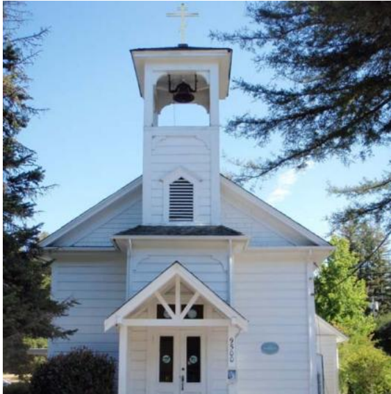
St. Peters Wee Kirk Church in Ben Lomond, on the National Register