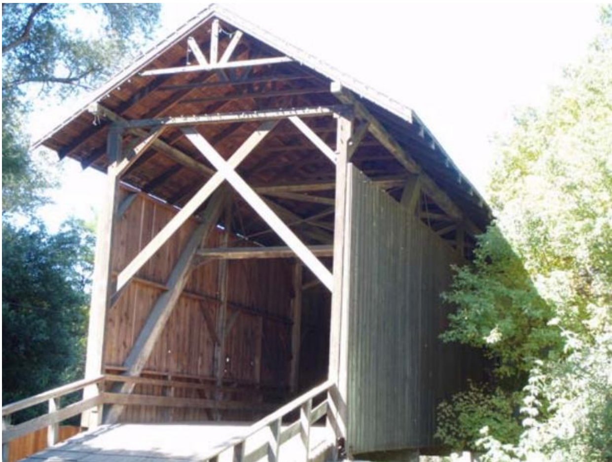
Felton Covered Bridge, on the National Register of Historic Places

ARC-8.2q Continue the review of proposed applications for demolition of any structure more than 50 years old that has not been previously surveyed for historic significance, and require a historic report prepared by a qualified historic consultant for structures that may have the potential to qualify as a historic resource as determined by County Planning staff. (Responsibility: CDID)