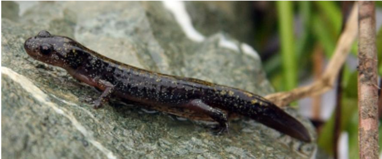
Juvenile Santa Cruz Long-toed Salamander, Ellicott Slough.

ARC-3.1.11 (LCP) Santa Cruz Long-Toed Salamander Habitat. Support state and federal preservation of the Santa Cruz long-toed salamander habitat in various state parks and preserves.