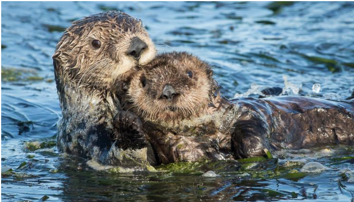
California Sea Otter

ARC-3.4d (LCP) Support efforts to prevent disturbance to shorebird resting and roosting sites by roping off sensitive areas, posting explanatory signs, and other means. (Responsibility: State Parks, California Department of Fish and Wildlife)