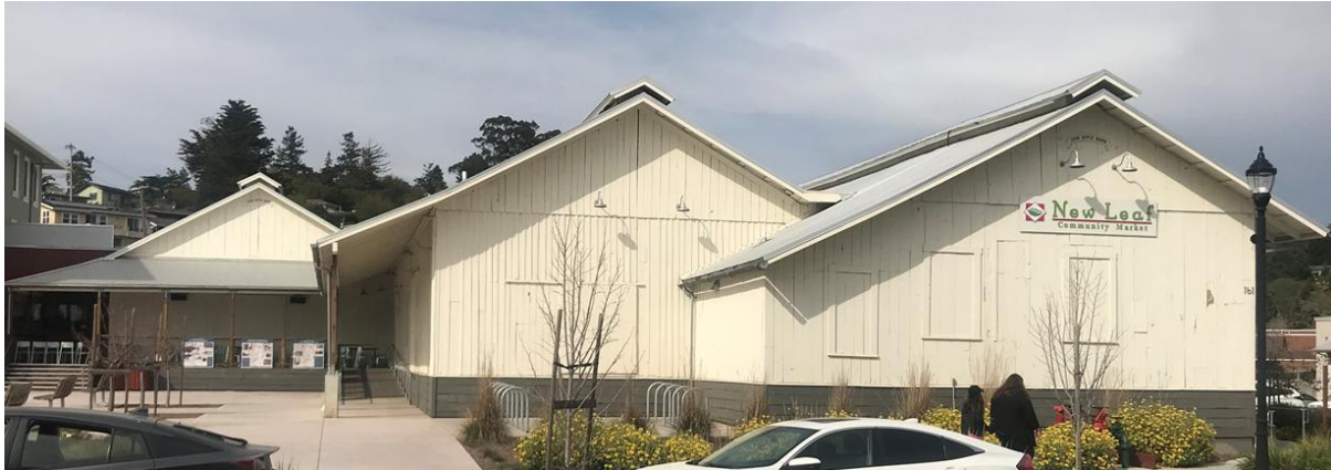
Hihn Apple Packing Shed, Historic Resource in Aptos Village