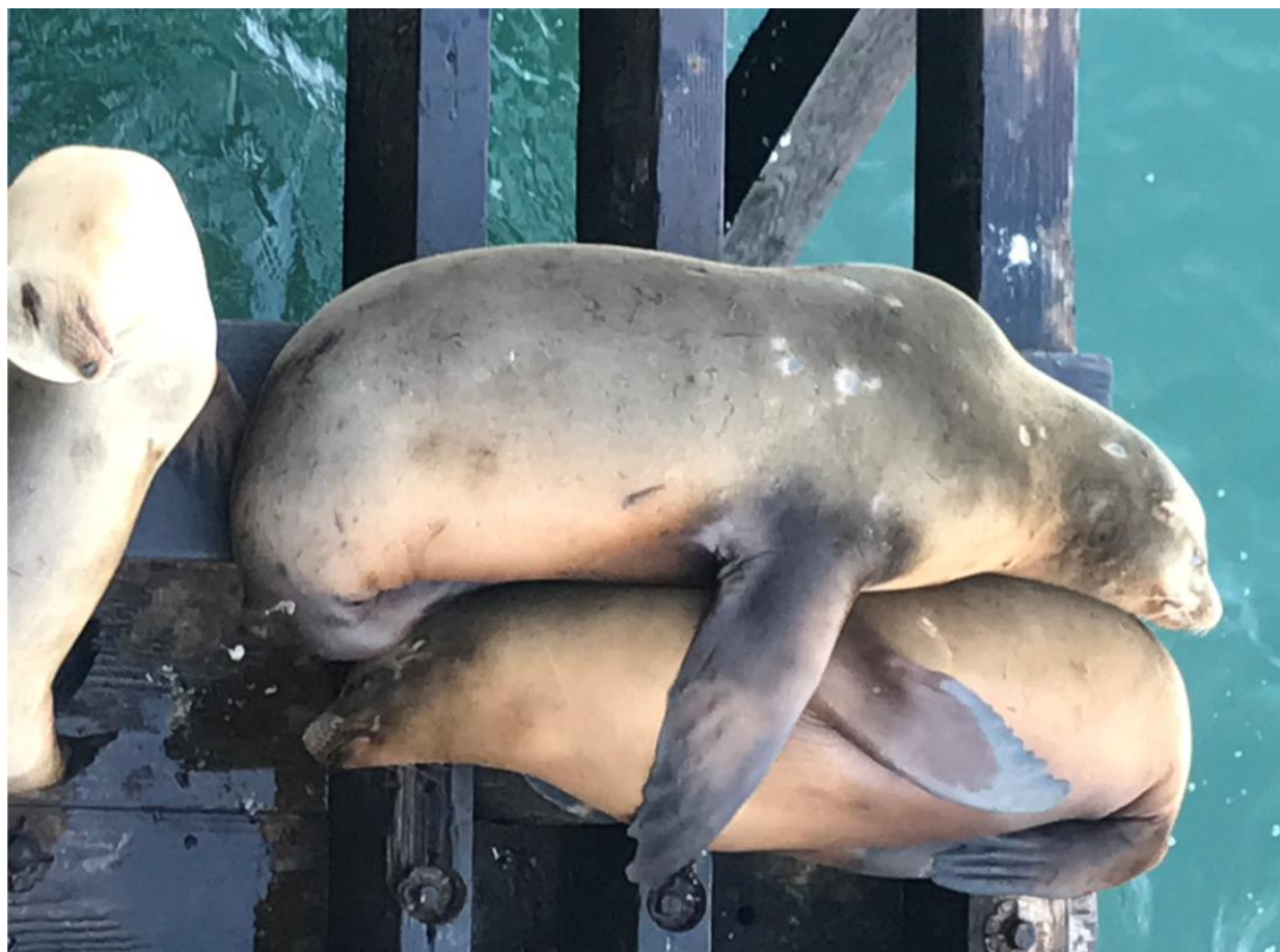
Sea Lions, Santa Cruz Wharf

ARC-3.4h (LCP) Identify and restore aquatic and marine habitats that have been damaged due to human activities. (Responsibility: California Department of Fish and Wildlife, Board of Supervisors).