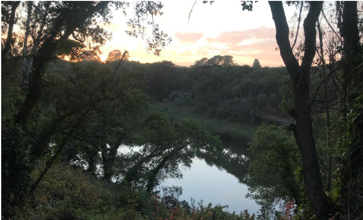
Schwan Lake at Twin Lakes State Park.

See also Appendix K: Sensitive Habitat Plant and Animal Species .