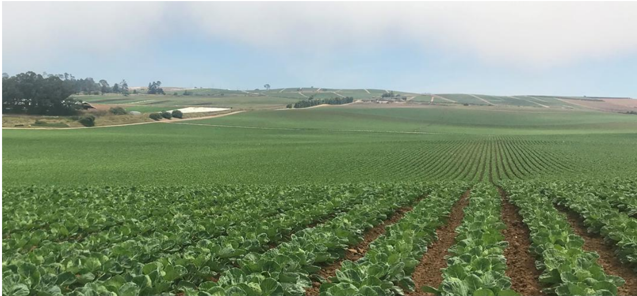
Agricultural fields in Corralitos

See Objective ARC-1.1: Preserve Commercial Agricultural Lands for Agricultural Use, Objective ARC-1-2: Land Divisions of Commercial Agricultural Lands, and Objective ARC-1.3: Prevent the Conversion of Commercial Agricultural Land.