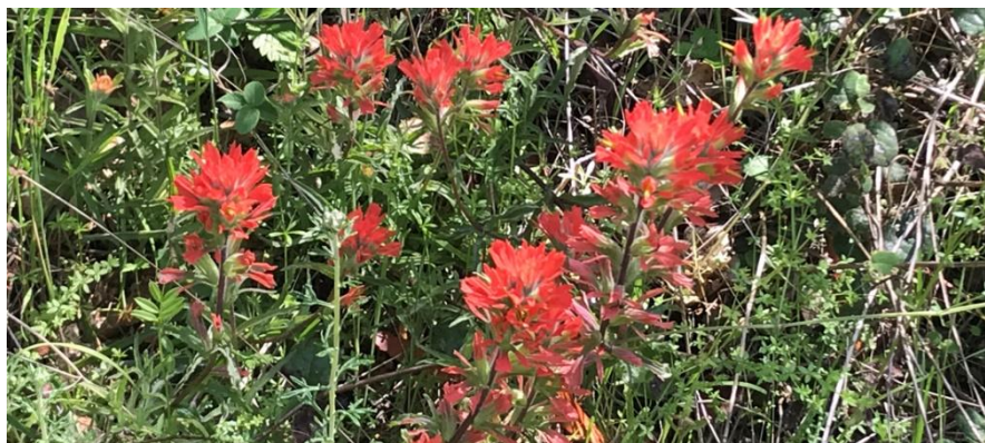
Indian Paintbrush.

Sensitive habitats in the County may provide some of the last remaining habitat for plants and animals in danger of extinction due to low numbers of individuals or populations, or to highly limited, fragmented, or vulnerable habitats. This policies in this chapter, implemented by SCCC Title 16, carefully regulate development to protect and restore sensitive habitats, and the rich biological diversity and special status species these habitats support, consistent with state and federal regulations. Some habitat areas are also considered to be Environmentally Sensitive Habitat Areas (ESHAs), which is a term that applies only within the Coastal Zone. Coastal Act Section 30107.5 defines ESHA as "any area in which plant or animal life or their habitats are either rare or especially valuable because of their special nature or role in an ecosystem and which could be easily disturbed or degraded by human activities and developments." ESHA policies and limitations may affect development of all or portions of properties containing an ESHA.