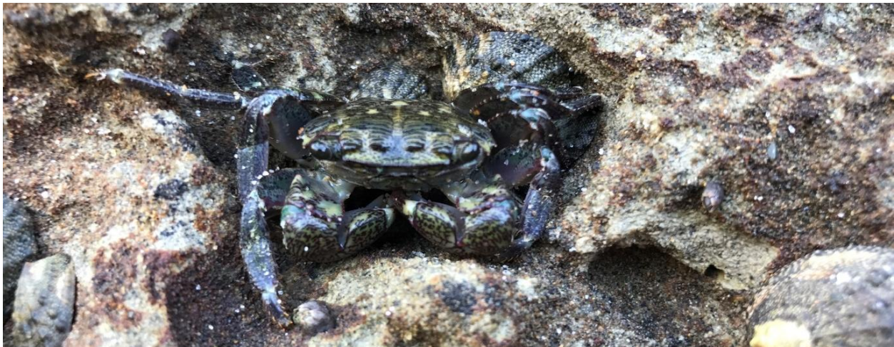
Crab in tide pools.

ARC-4.1.13 (LCP) Redistribution of Dredged Materials. Require the redistribution of dredged materials into the same littoral cell from which it was taken in an effort to continue beach replenishment as long as the materials are suitable and non-toxic, and the deposition of the materials will not adversely affect marine environments or recreational uses. The deposition of such materials must be timed and located so as not to interfere with shoreline processes, longshore current systems, and public beach use.