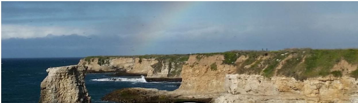
Santa Cruz County North Coast.

In addition to policies in the Open Space section, other policies in this element that protect natural resources, visual resources, and tribal resources also protect the open space values of these lands. Chapter 7: Parks, Recreation + Public Facilities also identifies and protects parks, recreation, and open space lands for outdoor recreation, and policies of that chapter further protect the open space character of those areas.