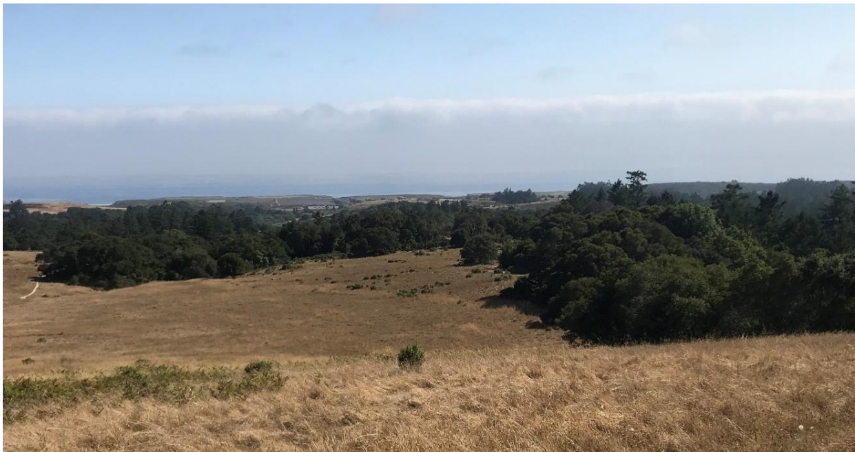
Wilder Ranch State Park

In 1978, forward-thinking citizens of Santa Cruz County passed the Measure J voter initiative, which established the Urban and Rural Services Lines and other policies to preserve and protect these important resources for current and future generations. Since 1978, County land use policies have directed development to urbanized areas where services are available, and limited land divisions, development density and allowable land uses outside these areas and in areas with natural resources. Guided by the principle to preserve the County's unique natural resources and habitats by carefully managing new development outside the urban and rural services line, the Agriculture, Natural Resources + Conservation Element continues to preserve agricultural land for agricultural use; protect cultural resources; protect and restore natural resources including sensitive habitats and scenic areas; provide for the long-term sustainable management and conservation of water, timber, and mineral resources; and preserve open space in rural and urban areas.