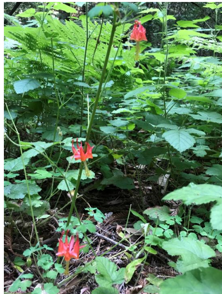
Shooting Stars in Grassland habitat (left) and Columbine in Redwood Forest habitat

ARC-3.1q Support private and non-profit organizations' efforts to promote community awareness of Santa Cruz County's rich biological systems and their vulnerability to climate change, as well as their role in mitigating climate change. Develop approaches to track indicators of the effects of climate change on important biological systems. (Responsibility: CDID, Environmental Health)