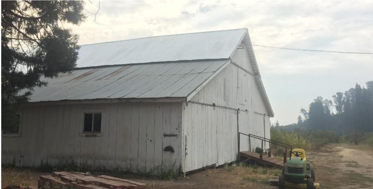
Silva Ranch Barn in Corralitos

ARC-1.1.13 (LCP)(EJ) Utility District Expansion. Prohibit the expansion of County-controlled sewer district boundaries, and oppose the expansion (through annexation) of special district, or municipal, sewer or water boundaries, onto Types 1 and 3 Commercial Agricultural Land , except under the following exceptional circumstances related to public health and safety; and where sewer and water lines are located well below tillable soil depths and with sufficient construction and buffers from pipelines to ensure public health and safety; and where consistent with Built Environment policies BE-5.5.1 through BE-5.5.5 regarding the San Andreas Planning Area: