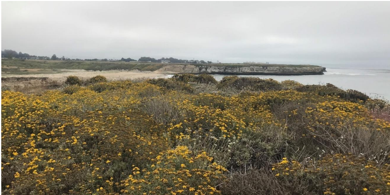
Wilder Ranch State Park

Public roads provide the broadest range and greatest level of public access to the various scenic and aesthetic resources within the County, offering important viewing areas and scenic corridors. Scenic roads and highways, such as portions of Highway 1, as well as Highways 9, 17, 35, 152, and 236, and local County roads provide public views of the Monterey Bay, agricultural fields, dense redwood forests, open meadows, and mountain hillsides. Any public vistas from County-designated scenic roads are afforded protection, and developments that could affect these vistas are carefully reviewed.