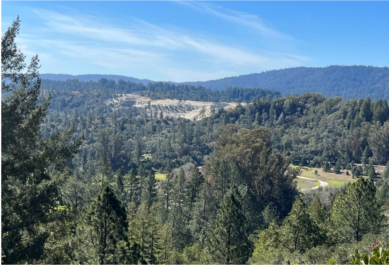
Quail Hollow Ranch County Park with view of the Quail Hollow Quarry