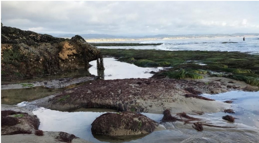
Tidepools in Pleasure Point.

Implementation of the policies in the Agriculture, Natural Resources + Conservation Element requires close coordination and cooperation with local, state, and federal agencies, including local water and sewage disposal agencies, the Resource Conservation District, the California Department of Fish and Wildlife, the California Coastal Commission, the Regional Water Quality Control Board, and the California Department of Forestry. Details are provided in the policies and implementation strategies.