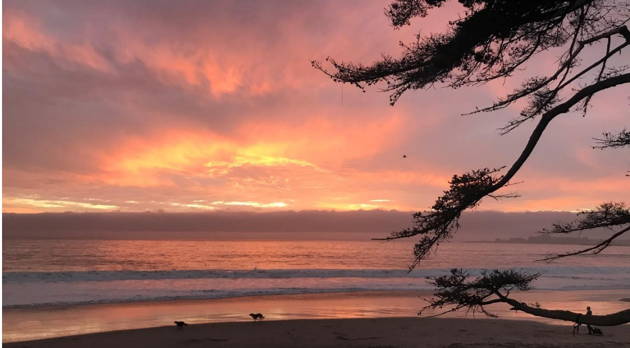
Twin Lakes State Beach

See also Objective PPF-4.4 Flood Control, Drainage + Stormwater and associated policies and implementation strategies.