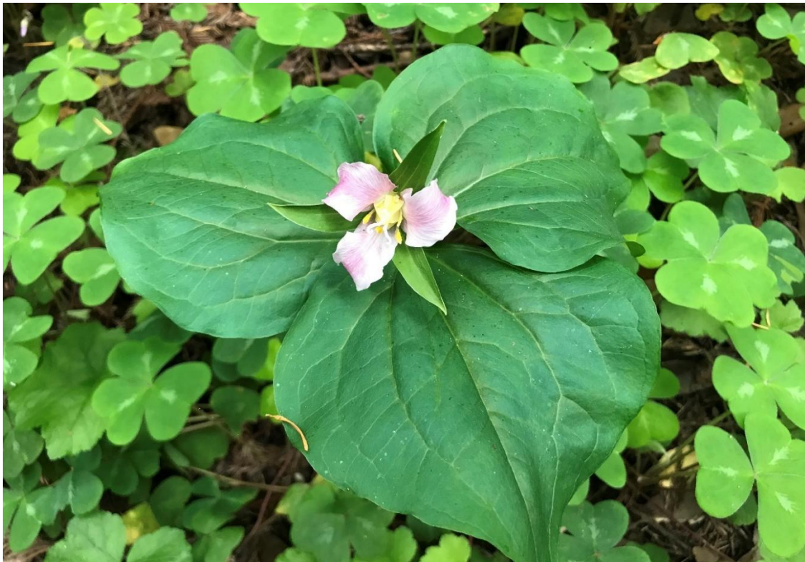
Trillium in Redwood Forest.

ARC-3.1.6 (LCP) Development Within Sensitive Habitats. Sensitive habitats shall be protected against any significant disruption of habitat values, and any proposed development within or adjacent to these areas must maintain or enhance the functional capacity of the habitat. Reduce in scale, redesign, or, if no other alternative exists, deny any project that cannot sufficiently mitigate significant adverse impacts on sensitive habitats unless approval of a project is legally necessary to allow a reasonable use of the land.