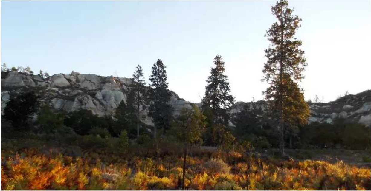
Rock formations near Bonny Doon Ecological Reserve