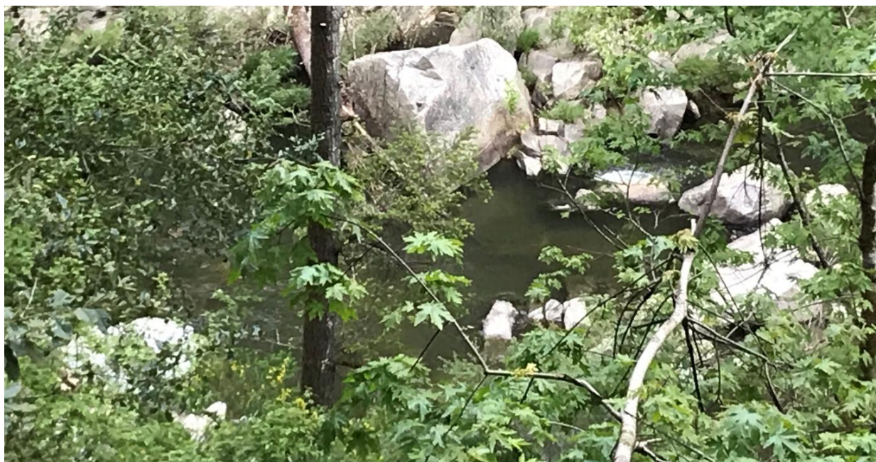
San Lorenzo River

ARC-4.3i (LCP) Coordinate with the City of Watsonville and PV Water to carry out projects that enhance or restore to the maximum extent possible in-stream flows on Corralitos and Browns Creeks. (Responsibility: CDID, Board of Supervisors, Environmental Health, City of Watsonville, PV Water)